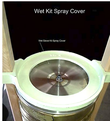
Wet Kit Spray Cover