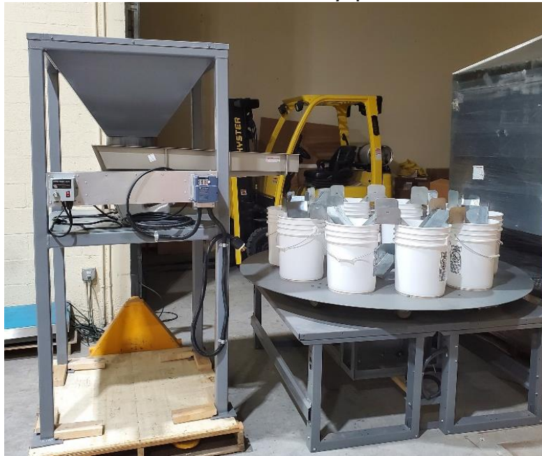
6' Diameter Rotary Splitter