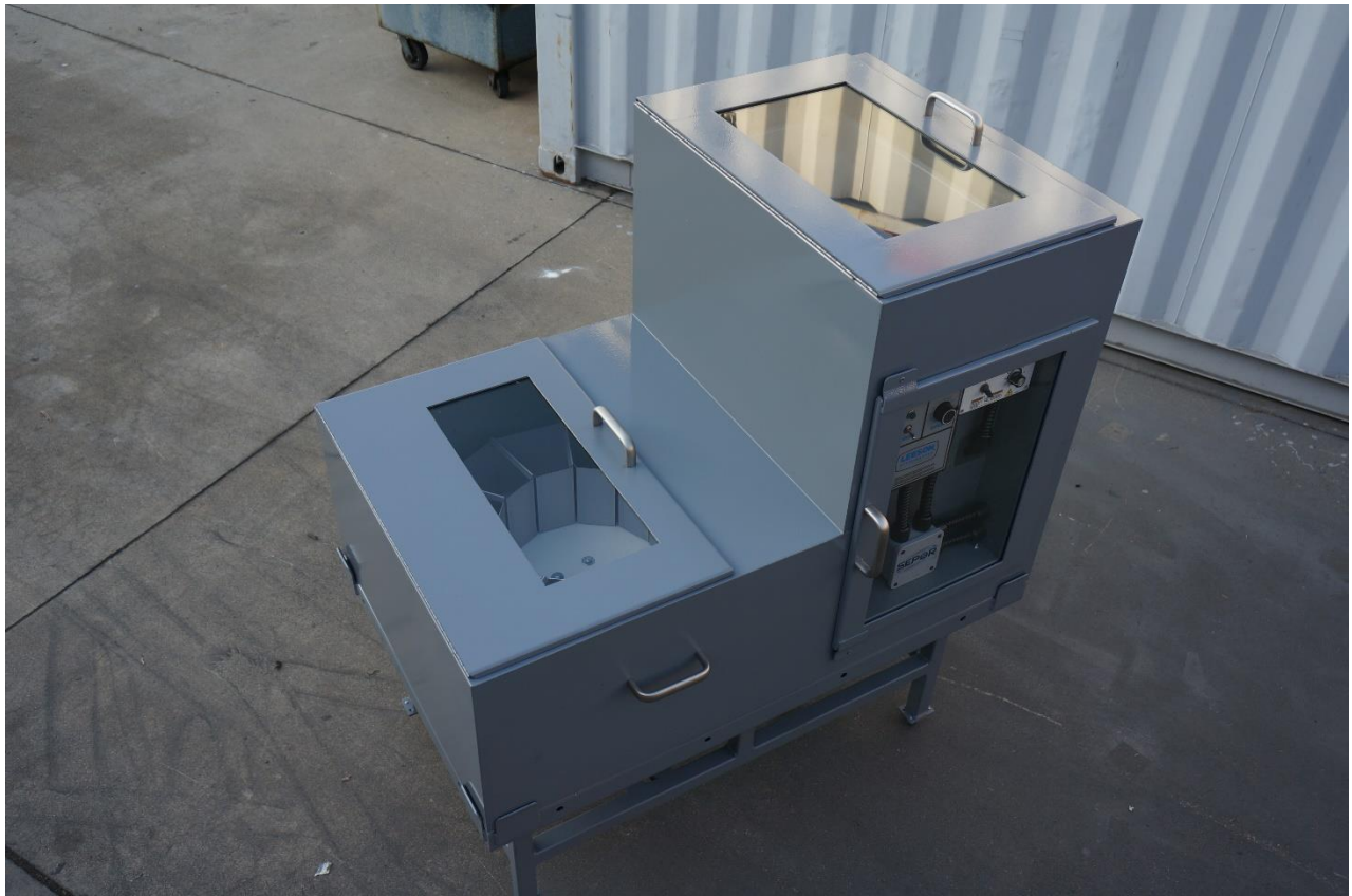
24 Inch Rotary Splitter with Dust Enclosure