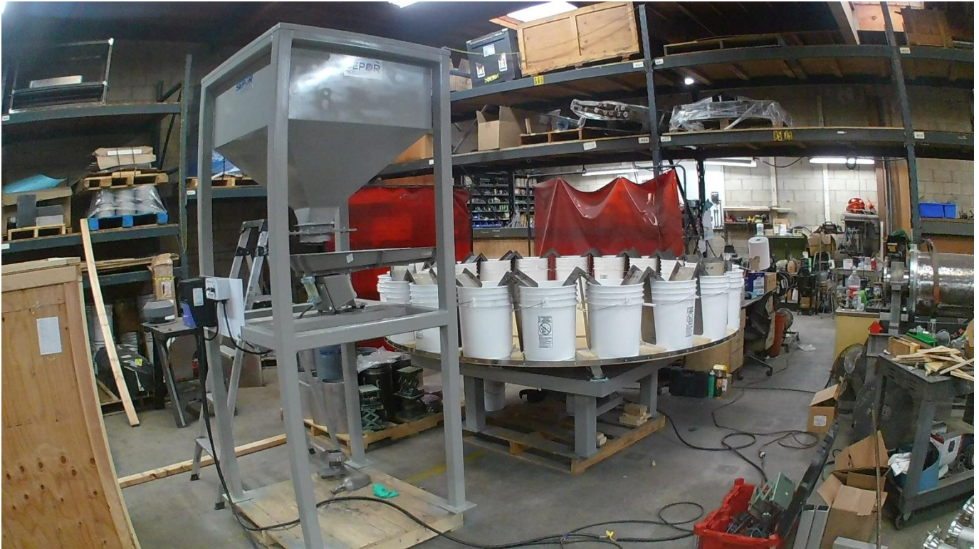
8' Diameter Table Rotary Splitter